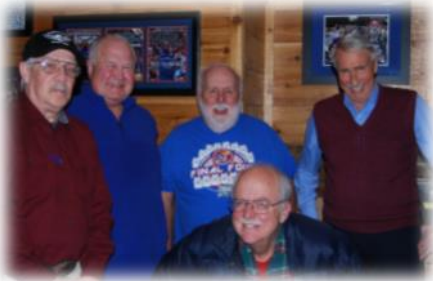
Club Officers for 2019...