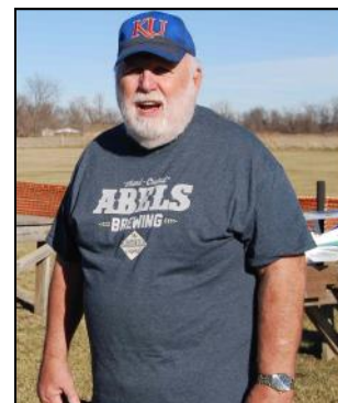
"I don't care if it's January 5th, I'm wearing my T-Shirt!"