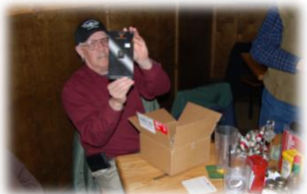
...and the winner of the door prize.