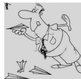
Oops...do I need to register this thing first?

If you're not in the FAA's UAS registration database or the system is simply messed up, you'll likely get an error message.